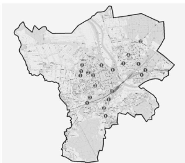
Figure 4. Spatial distribution of cluster analysis of snow samples taken in February.