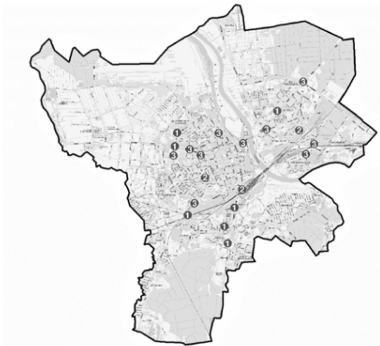
Figure 2. Spatial distribution of cluster analysis of snow samples taken in January.

The second cluster includes three sampling plots close to railway and industrial area. This cluster characterises with relatively low concentrations of Ca, Mg, Na, K, Co, Li, Sr, Al, P. The concentrations of Cu ( 28.7 \pm 4.22 \mu\text{g L}^{-1} ); Pb ( 7.3 \pm 0.85 \mu\text{g L}^{-1} ); Fe ( 0.3 \pm 1.5 \text{ mg L}^{-1} ); Zn ( 101.2 \pm 23.96 \mu\text{g L}^{-1} ); Ni ( 0.8 \pm 0.1 \mu\text{g L}^{-1} ); Cr ( 0.8 \pm 0.1 \mu\text{g L}^{-1} ); Mn ( 18.7 \pm 2.6 \mu\text{g L}^{-1} ); Ti ( 3.8 \pm 0.99 \mu\text{g L}^{-1} ); Ba ( 20.2 \pm 6.74 \mu\text{g L}^{-1} ) are higher than the first and third cluster and significantly higher than in natural areas (Shevchenko, 2016). The higher concentrations of Cu, Pb, Fe, Zn, Ni, Cr, Mn are associated with fossil and oil combustion (Pacyna & Pacyna, 2001).